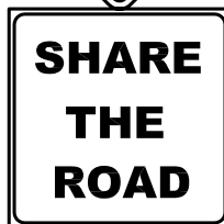
W11-1 MOD. W16-1